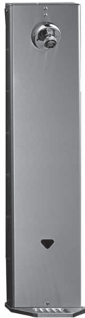
Figure 1 ESP Hydropanel™ II Infrared Sensor Shower System

Traditional metering valves are prone to maintenance and mechanical failure due to component wear, lime build-up and vandalism. Electronic Sensor Plumbing systems are much more reliable, with proven solenoid valves, solid state electronics and vandal resistant sensor assemblies.