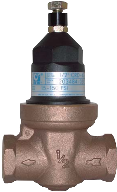
1/2" CRD-40 Pressure Reducing Control Valve